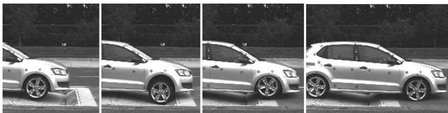
Figure 1: Driving over a pothole or cross-drain [1].

Within a joint project between EDAG and a well-known automotive company the usability and accuracy of a new coupled approach was evaluated. The general idea was to replace bigger parts of the previous FEA model by reduced MBS systems and to couple both simulations in a single application. All critical components with nonlinear deformations can be calculated in Abaqus with the same accuracy as in the full FEA model. However the majority of parts are modeled as rigid bodies or flexible superelements in MSC.Adams with less complexity. These MBS system models are re-used from the standard vehicle dynamics workflows. Both models can be coupled through the standard interface MpCCI.